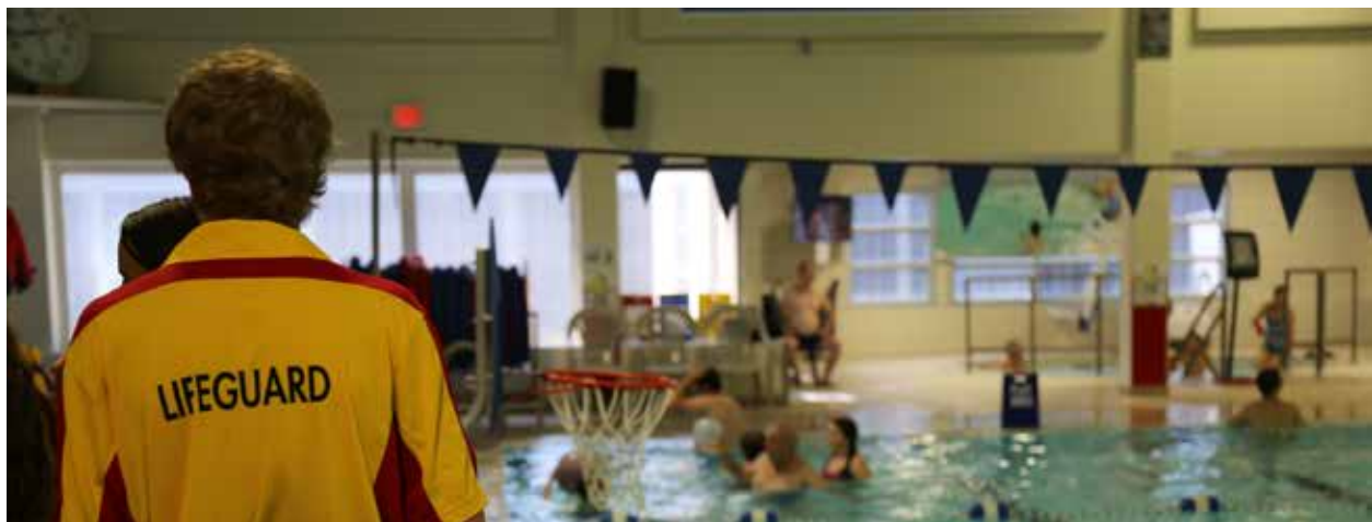
Lifeguard Positioning Analysis (LPA)