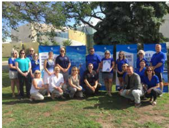
National Drowning Prevention Week flag raising ceremony at Edmonton City Hall

The Society participated in 33 TV and radio interviews about drowning preventing in 2018-2019, several of which were during NDPW.