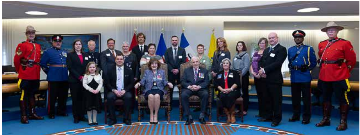
2018 Annual Investiture of Lifesaving Honours