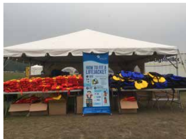
Lifesaving Society at EPCOR River Fest in Edmonton, Alberta