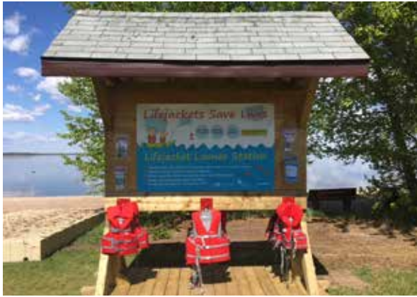
New Lifejacket Loaner Station in Lac La Biche

absent or distracted supervision. Consistent with previous years, males contributed to the vast majority of drownings. The age groups with the highest risk for drowning include children 0-4 years of age, young adults 20-34 years of age and seniors over the age of 65. The highest rates of drownings occurred between the months of May and September and in natural bodies of water such as lakes and rivers.