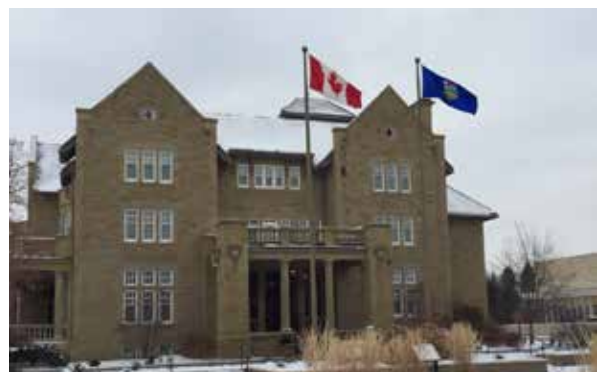
Government House, Edmonton, Alberta