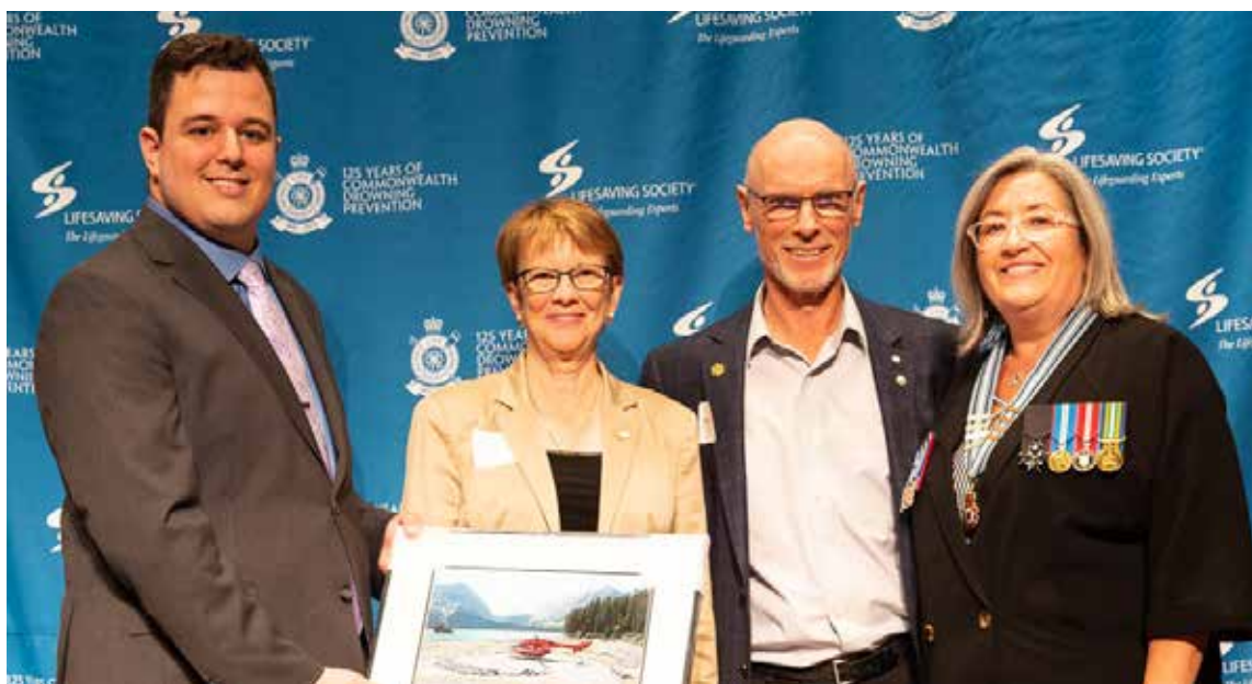
Special Presentation from STARS at the 2018 Annual General Meeting