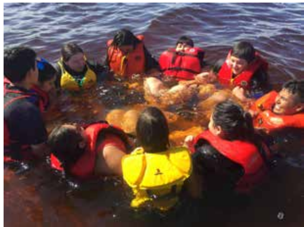
NWT Water Smart program delivery at the Mackenzie Recreation Association Recreation Leaders Camp July 2018