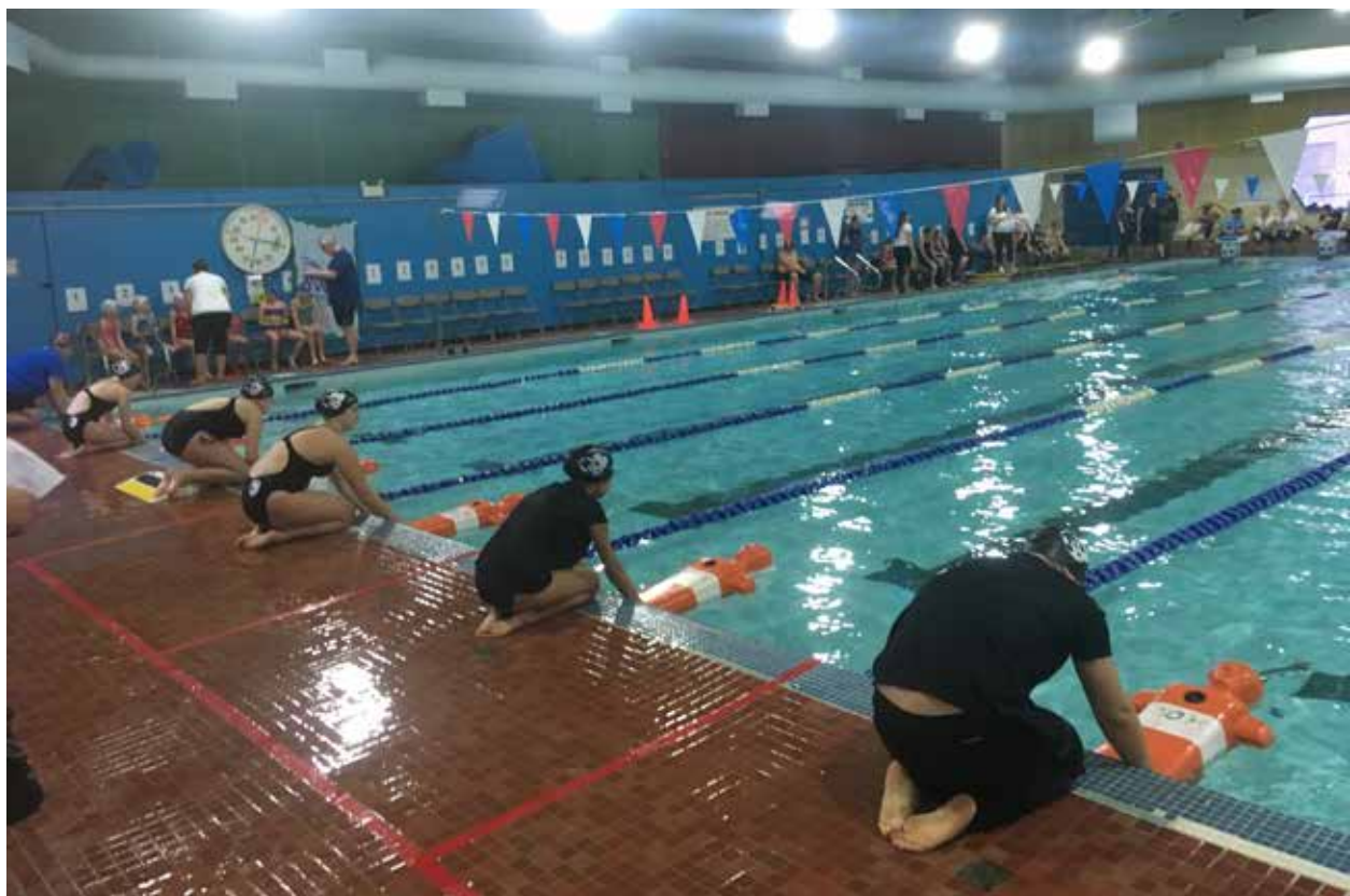
Hinton - Sanctioned Competition, November 2018

The 2018 Canadian Surf Lifesaving Championships were held on August 24-26, 2018 at Centre touristique du Lac-Simon, Duhamel, Quebec.