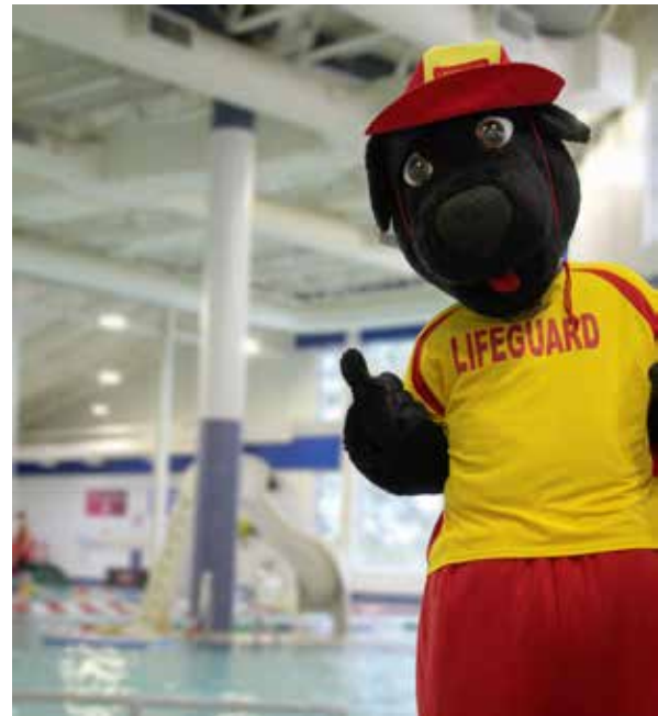
Buddy the Lifeguard Dog attending the YMCA Healthy Kids Day

The Society also partnered with the Canadian Safe Boating Council to send several seasonal co-branded media releases to promote safe boating behaviour as well as share social media posts.