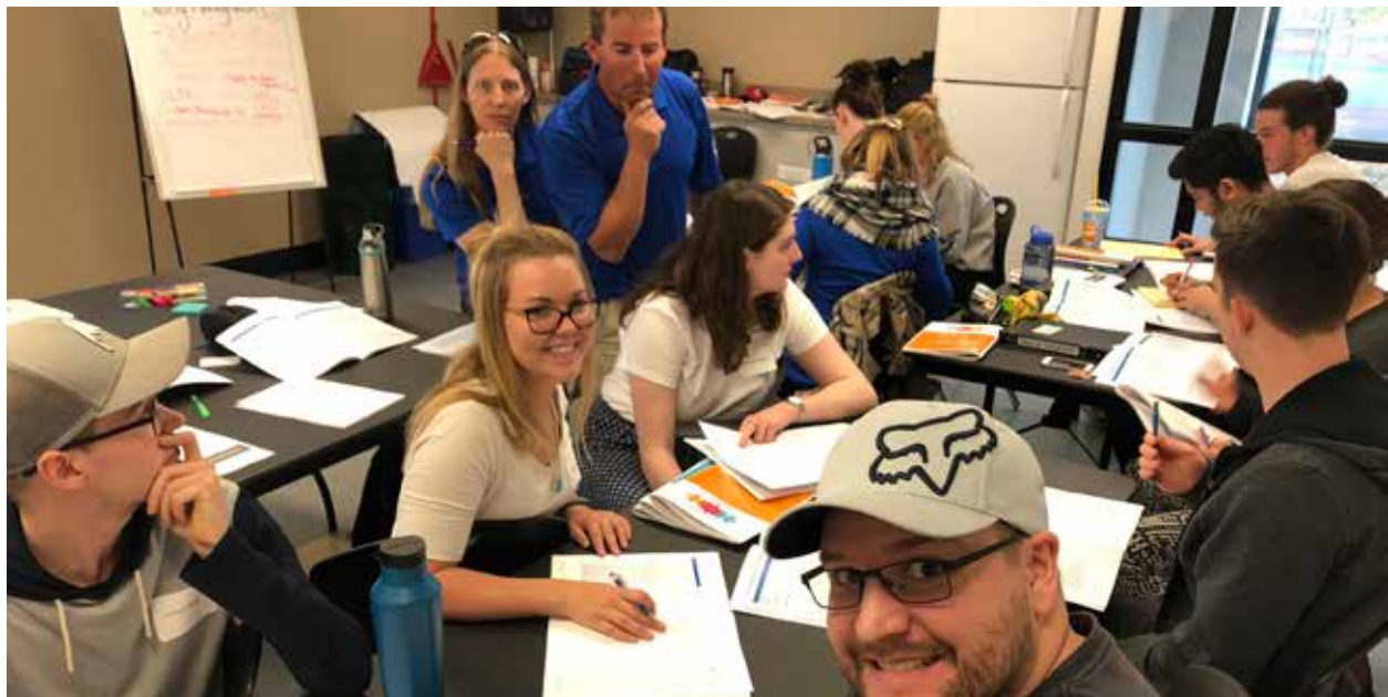
Trainer Course in St. Albert

Three (3) new affiliates join the Swim for Life family by offering the Lifesaving Society's learn to swim program in their community. All affiliate delivery partners delivering the Swim for Life program were sent hanging wall banners. The Society was pleased to be able to present many of these banners to affiliates in person and celebrate the success of the Swim for Life program.