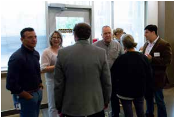
2018 AGM at Cardel Theater in Calgary

about our training programs, Water Smart® public education, safety management services and lifesaving sport. There were 82,156 visits to www.lifesaving.org in 2018-2019. Approximately 63% were new visits to the website.