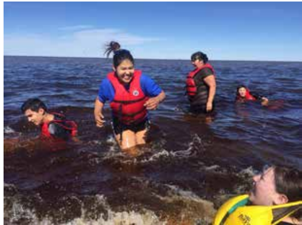
NWT Water Smart program delivery at the Mackenzie Recreation Association Recreation Leaders Camp July 2018