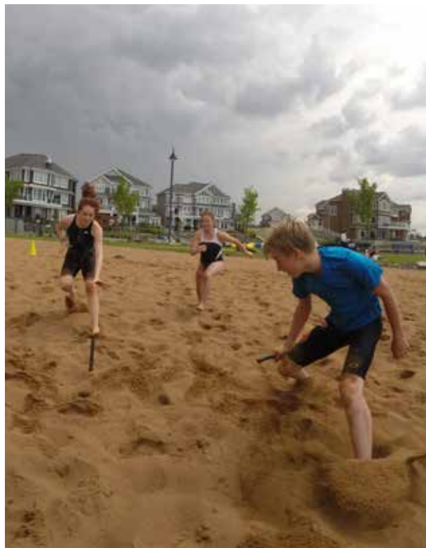
2018 Lifesaving Sport Camps

®Lifesaving Society, Water Smart, Swim to Survive, Swim for Life and National Lifeguard Service are all registered trademarks of the Royal Life Saving Society Canada.