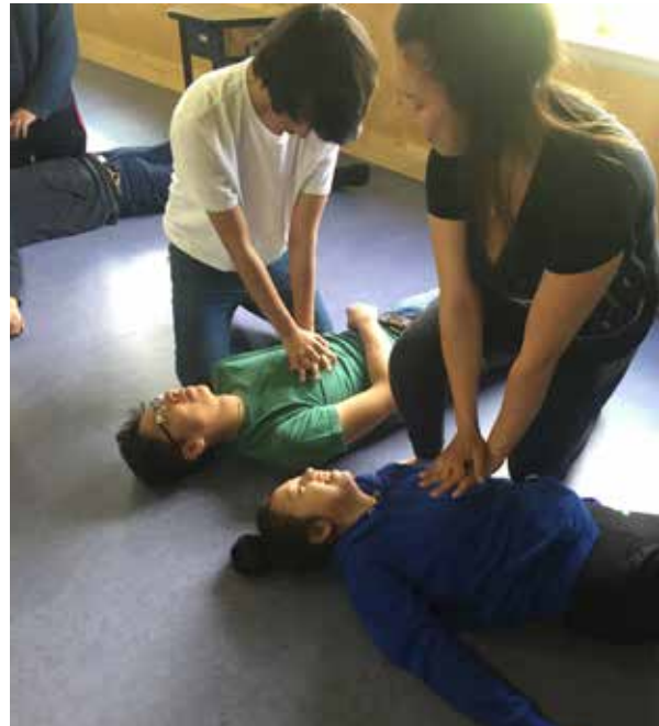
Emergency First Aid Training in Lutselk'e, Northwest Territories