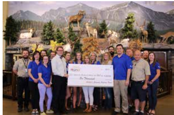
Cabela's cheque presentation in Northeast Edmonton

the Governments of Alberta and the Northwest Territories and volunteers across Alberta and the Northwest Territories for their continued support of this valuable program. The Society has maintained a partnership with Cross Country Parts Distributors who provide lifejackets at cost for our Lifejacket Loaner Stations. The Society provides banners for the Lifejacket Loaner Station program, which can be customized, as well as posters and maps for all of the Lifejacket Loaner Stations. The Society also provides Water Smart rack cards to all of the Lifejacket Loaner Stations.