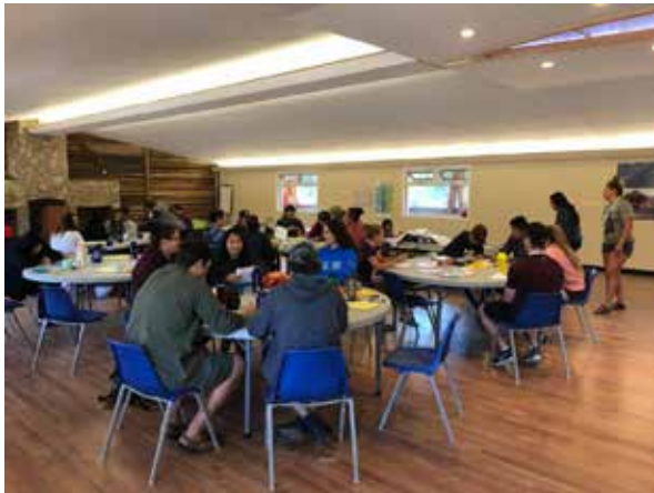
Lifesaving Society Presentation at the Mackenzie Recreation Association Recreation Leaders Camp July 2018

The Lifesaving Society also provided initial and mid-season staff training and development as well as Water Smart education to beach attendants at Fred Henne Territorial Beach in partnership with the Government of the Northwest Territories Department of Industry, Tourism and Investment (ITI).