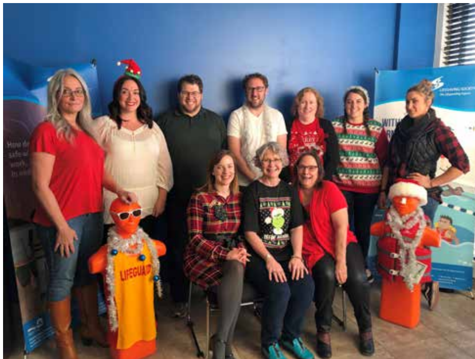
Lifesaving Society Staff, Christmas 2018