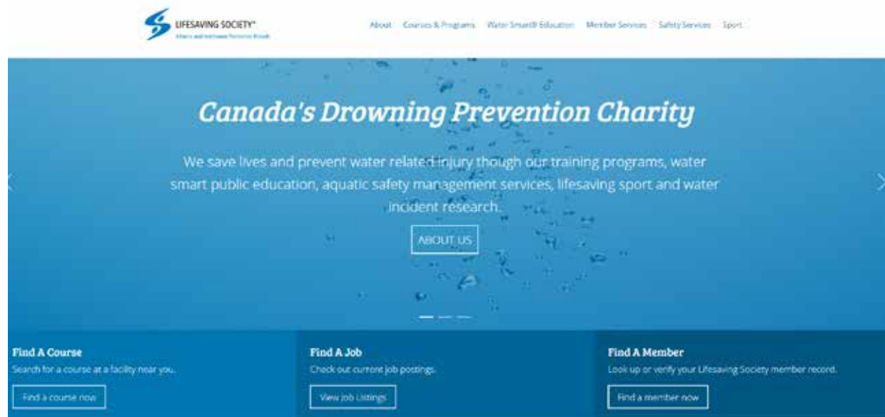
New Lifesaving Society website

The Lifesaving Society launched a new website on January 2, 2019. The Lifesaving Society website provides a wealth of information and resources for the public as well as our affiliate members. The website offers the ability to post a course, find a member, and post a job. Affiliate members and the public can access key information about Lifesaving Society branch events and courses as well information