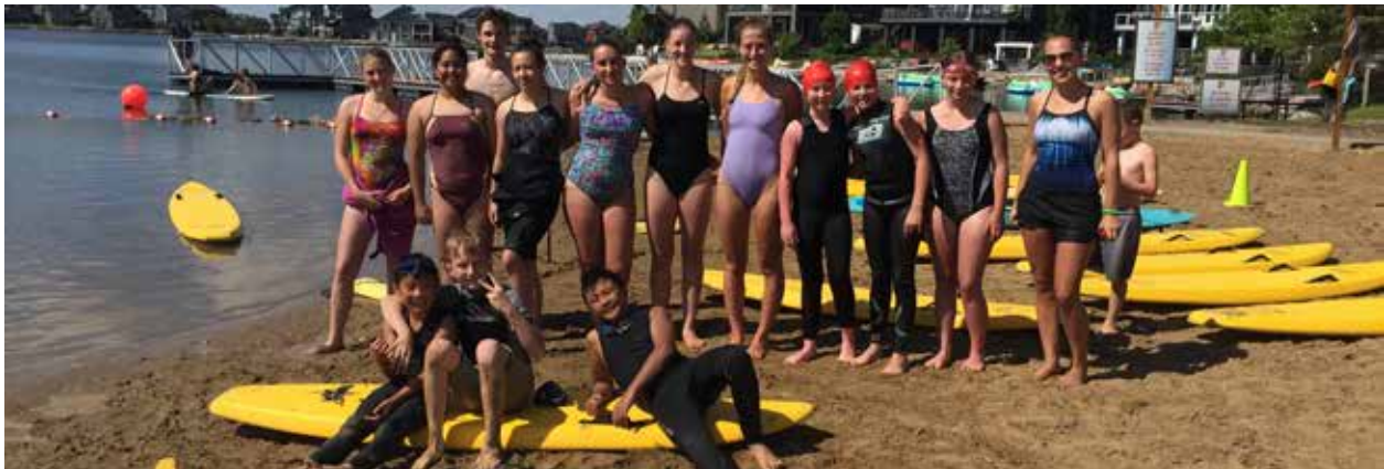
2018 Lifesaving Sport Camps at Auburn Bay in Calgary