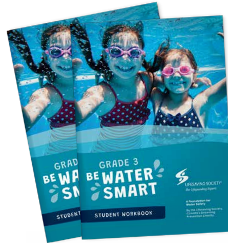
Grade 3 Be Water Smart program materials