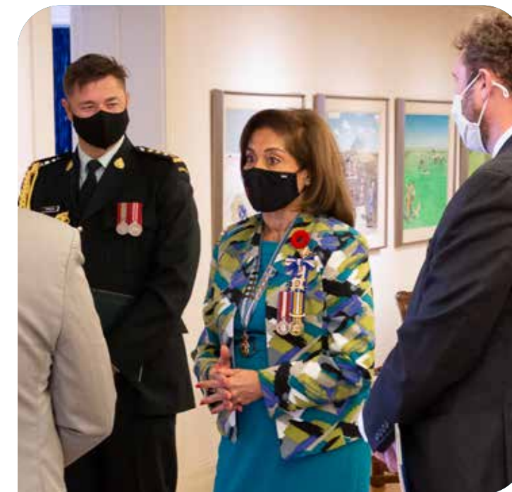
Her Honour, the Honourable Salma Lakhani, AOE, B.Sc.