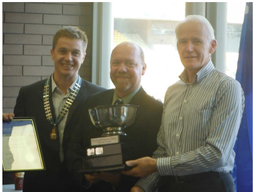
Photo taken at 2013 Annual General Meeting June 21, 2013 at Commonwealth Stadium in Edmonton, AB.

In 2013 the Society created a YouTube channel page to post videos for the public to teach about Water Smart®, to assist members with training programs and to share news about drowning and injury prevention from across the world. Visit our YouTube channel: Lifesaving AB/NWT .