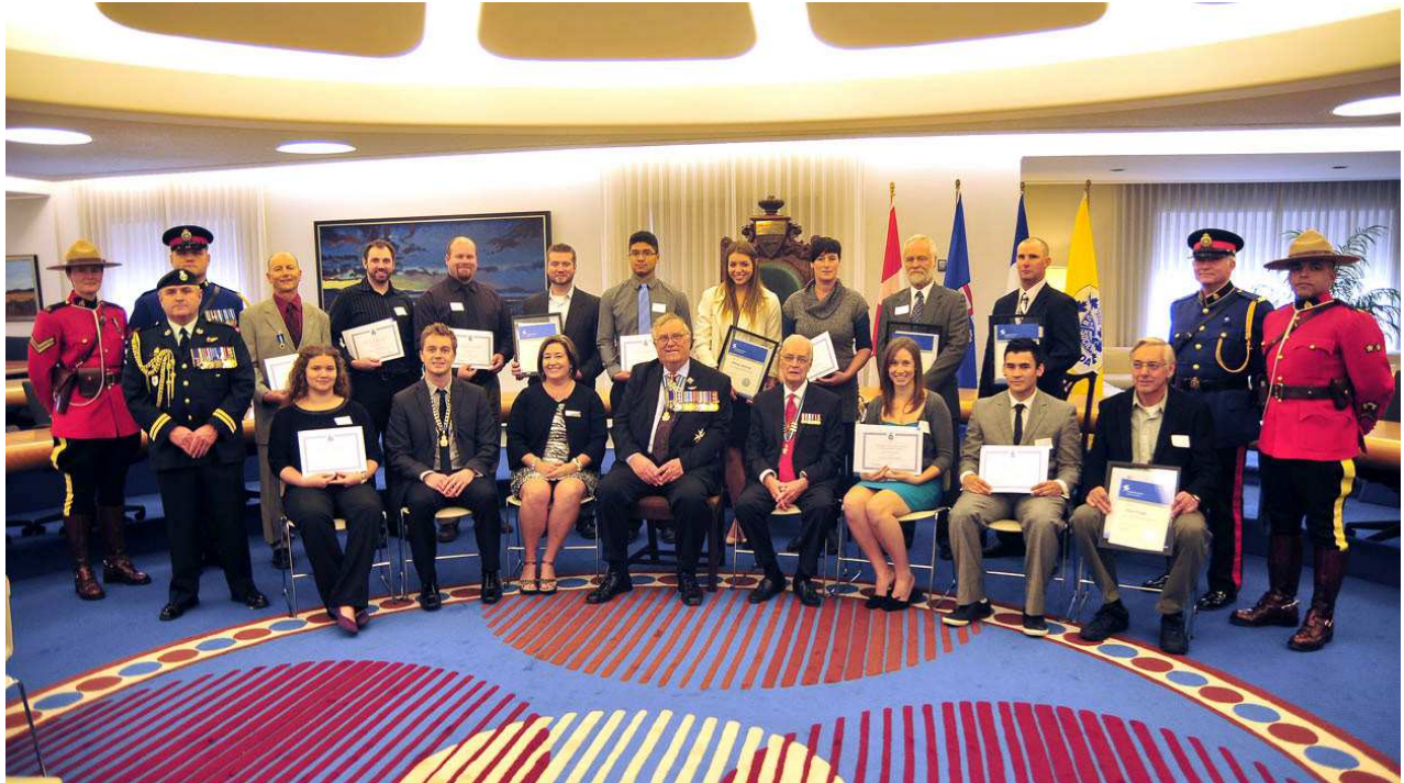
Photo taken at Investiture of Honours and Rescue October 10, 2013 at the Government House in Edmonton, AB.

Member Services contributes to the mission of the Lifesaving Society by developing and maintaining essential corporate functions dedicated to supporting and servicing the membership of the Society. Specifically, Member Services provides the Society with administrative systems and infrastructure for the operation of programs and services including customer service, volunteer support, record keeping and documentation including corporate history (archives). Member Services ensures regulatory compliance to sustain the Society's corporate and legal entity and to ensure the Society's activities and operations are consistent with current legislation and regulatory requirements.