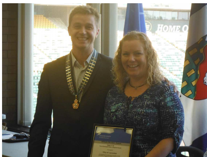
Photo taken at Annual General Meeting and Branch Awards June 21, 2013 at Commonwealth Stadium in Edmonton, AB.