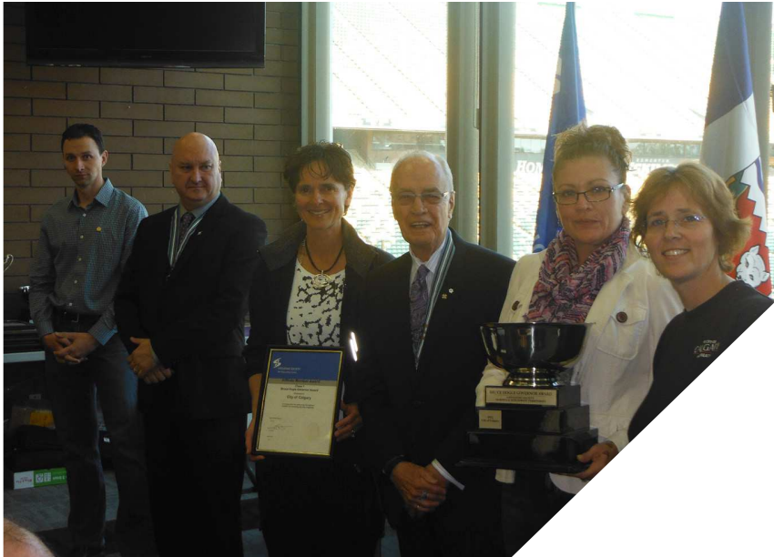
Photo taken at Annual General Meeting and Branch Awards June 21, 2013 at the Commonwealth Stadium in Edmonton, AB.

Training Programs contribute to the mission by: teaching Canadians swimming and lifesaving skills, and giving Canadians the knowledge and judgment they need to enjoy water safely and to save themselves and rescue others in an emergency.