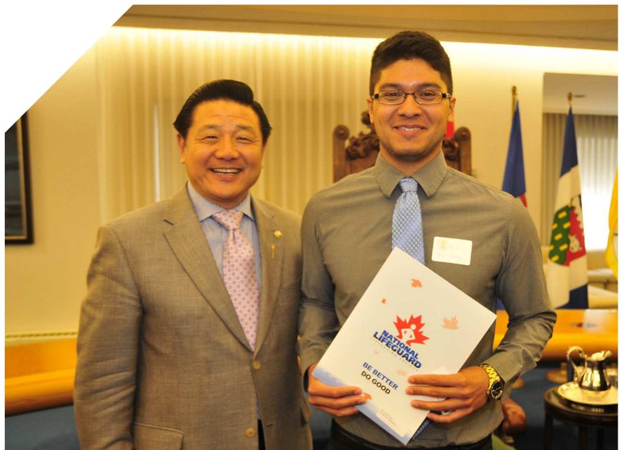
Photo taken at the 2013 Investiture of Honours and Rescue Investiture October 10, 2013 at the Government House in Edmonton, AB.