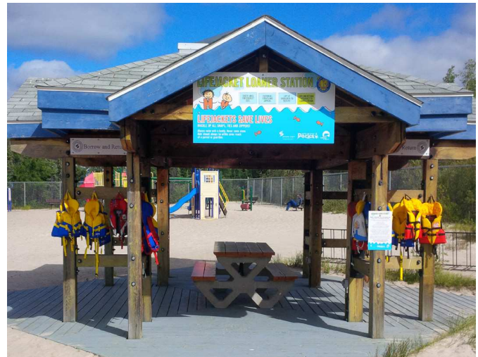
Fred Henne Territorial Park Yellowknife, Northwest Territories