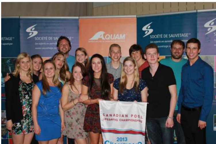
Photo taken at 2013 Canadian Pool Lifesaving Championships in Trois Riviere, Quebec.